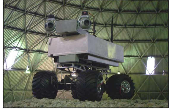
Figure 2: The Argo Rover, the robot used as a testbed [10].

processing at the “bottom” of the architecture and the symbol-